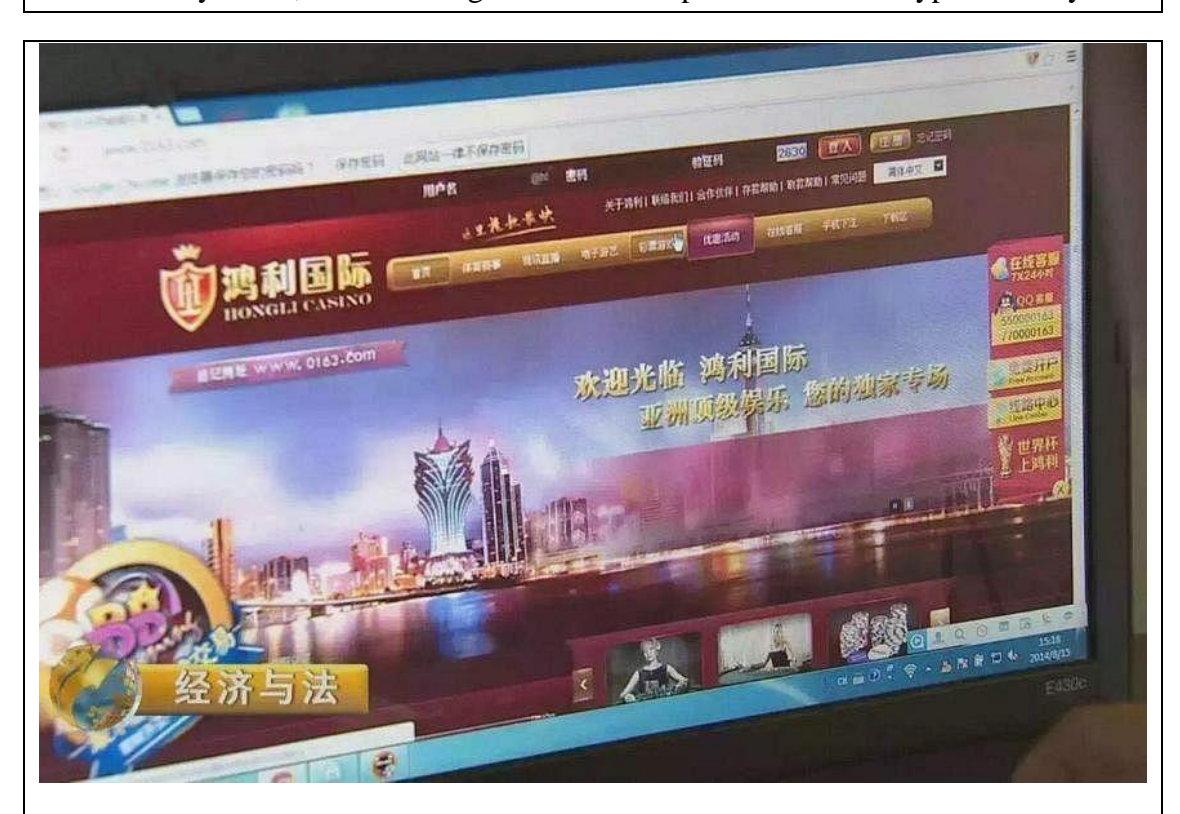
Figure 3 The Hongli International gambling site captured in 2014.

In summary, incredibly large amounts of illicit funds allegedly have been mingled with licit funds and properties around the world, facilitated by cryptocurrency, and almost certainly enabled by slavery.