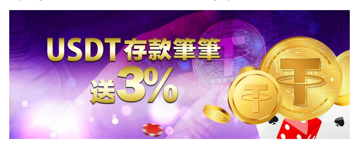
Figure 2 - a typical Tether promotion from an unlicensed betting website targeting Chinese customers offering a 3% rebate over other payment means

The purpose of accepting cryptocurrency as payment for betting thus cannot be seen as anything but a means to enable customers to bet illegally.